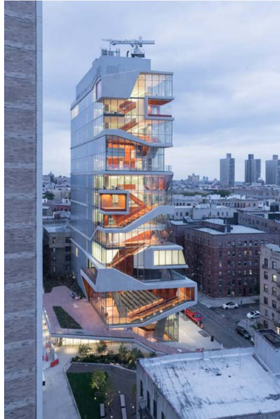
The Roy and Diana Vagelos Education Centre Columbia University transparent and open to the community

The University today is a very different, outward looking institution