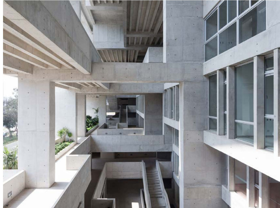
University of Lima by Grafton Architects giving the Specialist engineering University in Peru a higher more imposing and a distinctive vertical campus structure